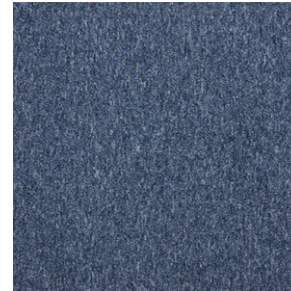
PA001 Blue Spar