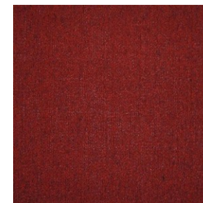
PA082 Red Sparks