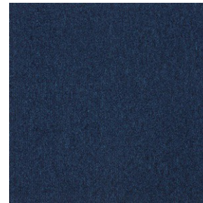
PA016 Ocean Blue