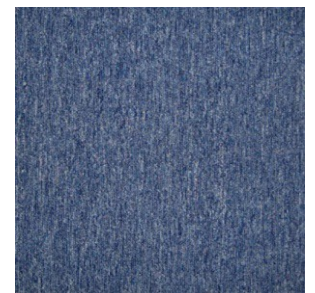
PA085 Blue Coral