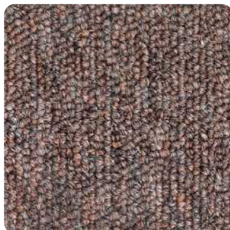
5800 Indian Spice