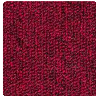
5362 Lush Red