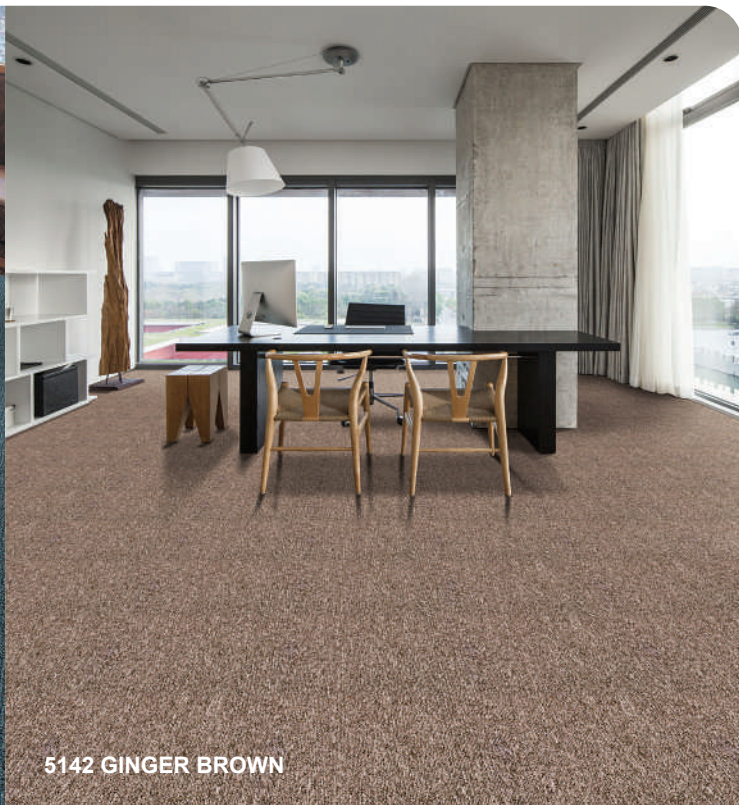
5142 GINGER BROWN