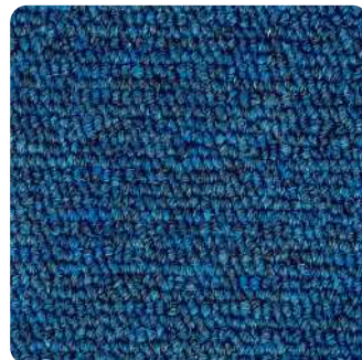
5156 Crystal Blue