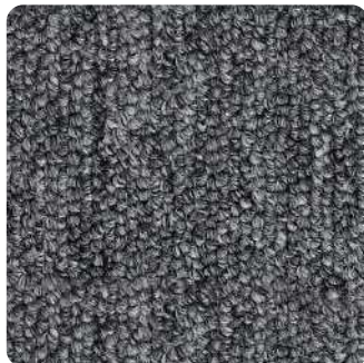
5336 Autumn Grey