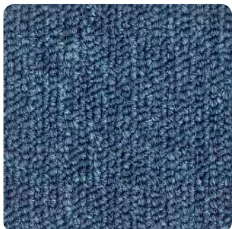
5746 Bristol Blue