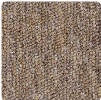
5142 Ginger Brown