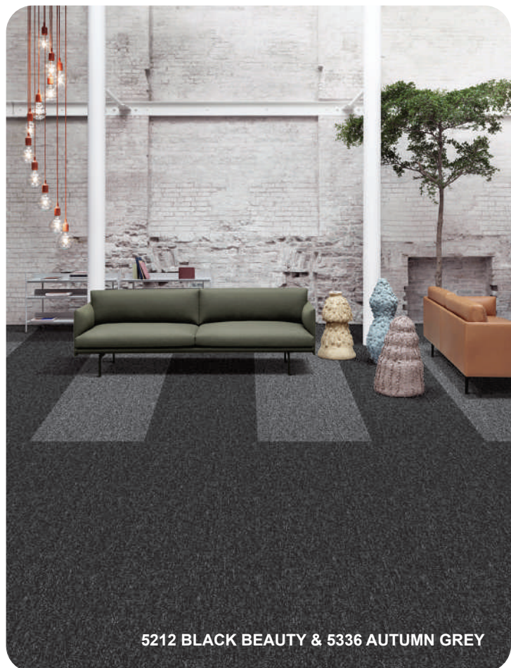
5212 BLACK BEAUTY &amp; 5336 AUTUMN GREY