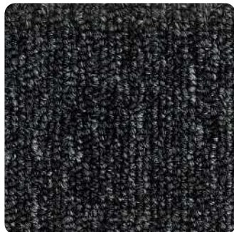
5212 Black Beauty