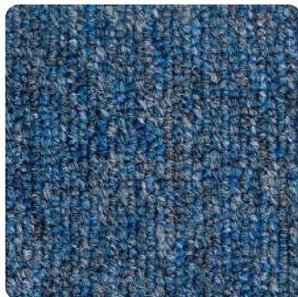
5155 Dalton Blue