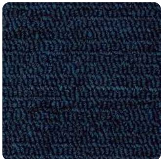
5248 Rich Blue