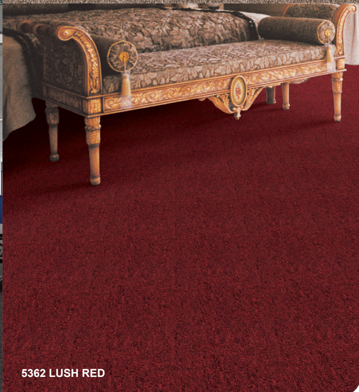
5362 LUSH RED