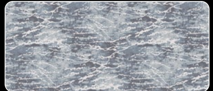
1277 CELESTIAL GREY