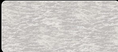
1255 ENCHANTED GREY