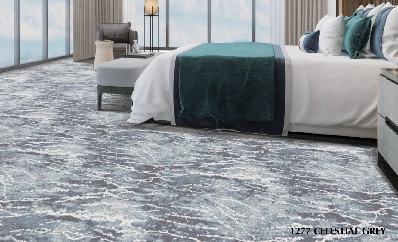
1277 CELESTIAL GREY

The delightful sheen on the pile surface of Royal Villa results in beautiful shading effects as shown in the accompanying pictures, which enhances the natural look and beauty of the carpet. This is not a defect but an inherent characteristic of this lovely carpet collection.