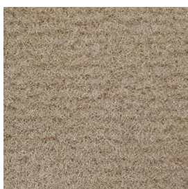
EL.260 Dark Beige