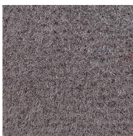
EL.840 Medium Grey