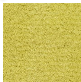
EL.540 Lime Green