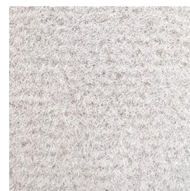
EL.880 Soft Grey