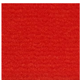
EL.130 Bright Red