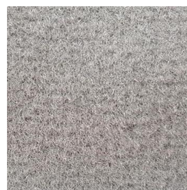
EL.830 Light Grey