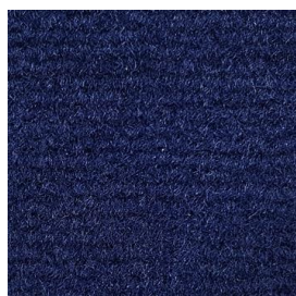
EL.790 Navy Blue