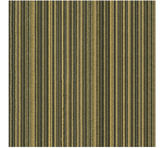
FP8006C Coffee Bean