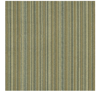
FP8006 Beige Sand