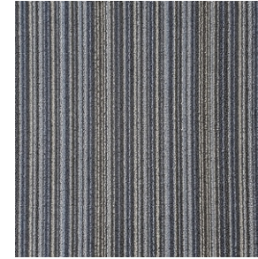
FP8006B Myth Grey