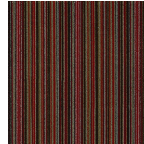
FP8006G Red Cherry