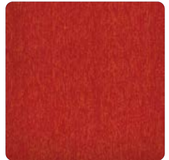
4154 DEEP ORANGE