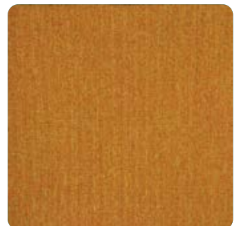
4156 CHROME YELLOW