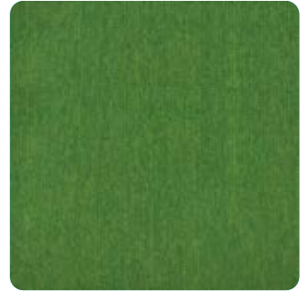
4152 MERRY GREEN