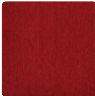
4155 VELVET RED