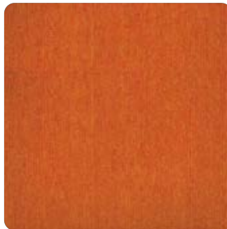
4153 LIGHT PEACH