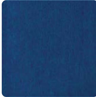
4151 BOBBY BLUE