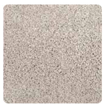
33 Sea Castle