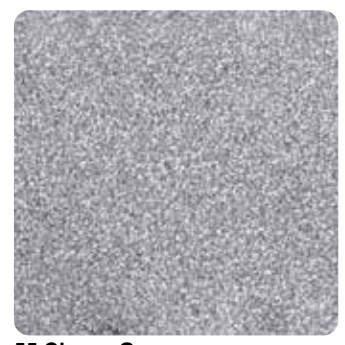
55 Classy Grey