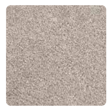
44 Sleek Wood