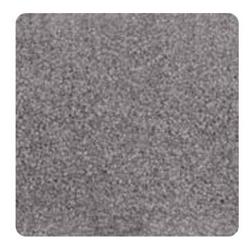
66 Moss Grey